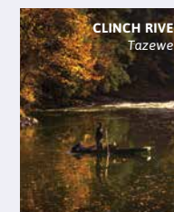
CLINCH RIVER Tazewell