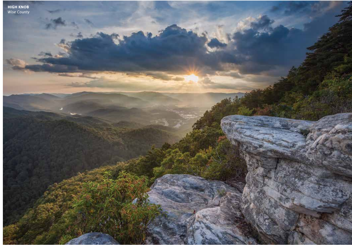
HIGH KNOB Wise County

5545 Browning Ln./Rt. 646 off Coeburn Mountain Rd., Wise; 276-679-0961; visitwisecounty.com. Stocked fishing, boat ramp, hiking and picnic facilities available.🐾